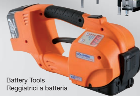
Battery Tools Reggiatrici a batteria