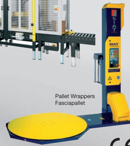
Pallet Wrappers Fasciapallet